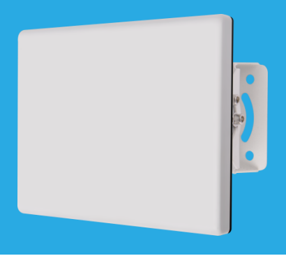
Wide Area Detection Radar